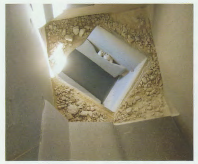
A rock box acts like a shelf, catching and distributing falling material onto the impact cradle.