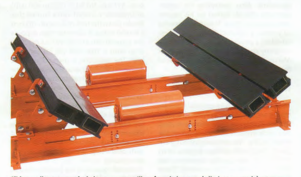
Slider cradles support the belt to prevent spillage from belt sag and eliminate material entrapment points.

The sidebars are "double-life," which means they can be flipped over when one side is worn, providing a second wear surface. Using only hand tools, a single worker simply removes the release pin and pulls the unit away from the frame on its