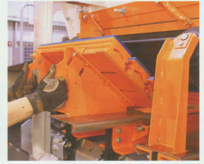
The modular impact cradle absorbs the impact of the falling load, yet slides in and out for easy service.

it often bent or cracked idlers and caused material to bounce, denting and scraping the skirt before it settled. Without being centered, the load would throw the belt off track and continue to shift throughout the transport process. This caused dust and fines to escape from the belt and pile along the conveyor's frame, clogging the maintenance walkway and obstructing access to the load zone.