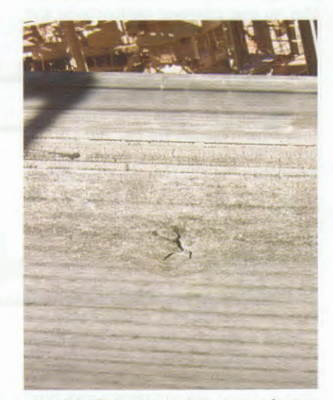
A receiving belt can experience severe damage from material transfers if it's not supported properly.

The loads of limestone would land on the fast-moving belt with such force that